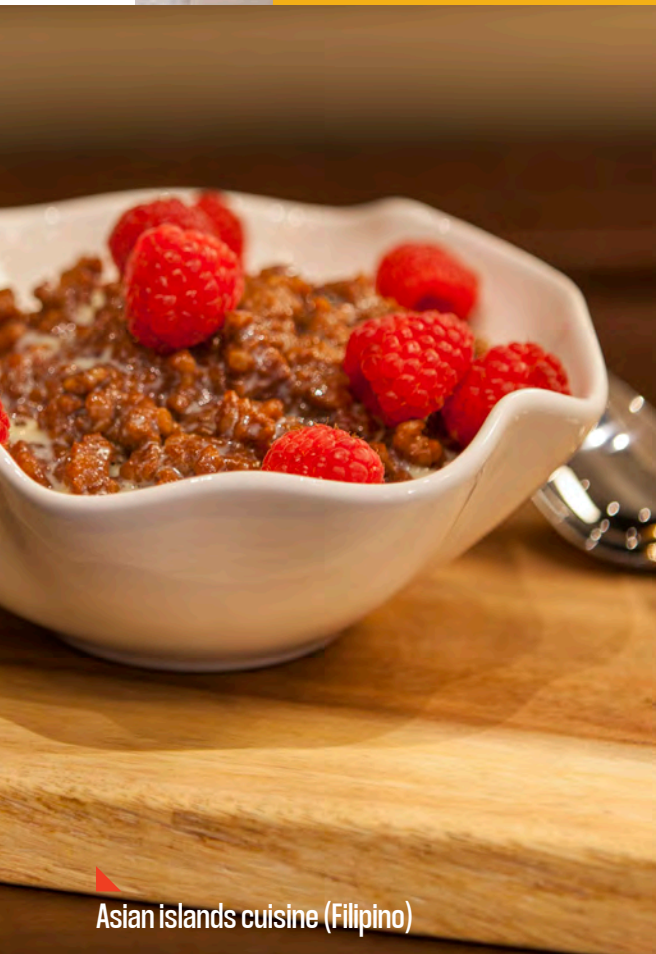
Asian islands cuisine (Filipino)

Asian spirits ( baijiu, soju, shochu, etc. )