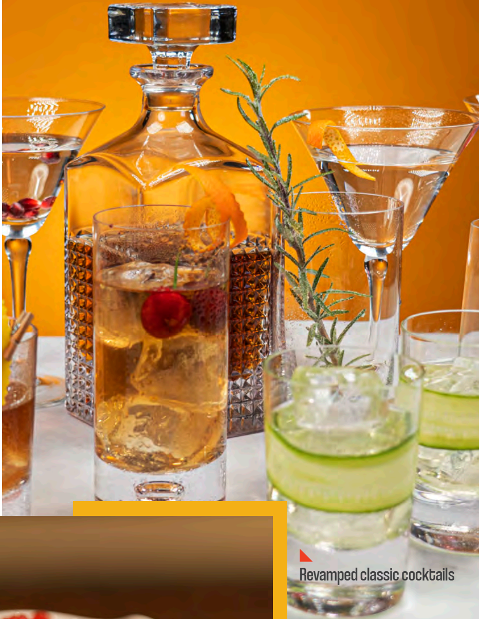
Revamped classic cocktails