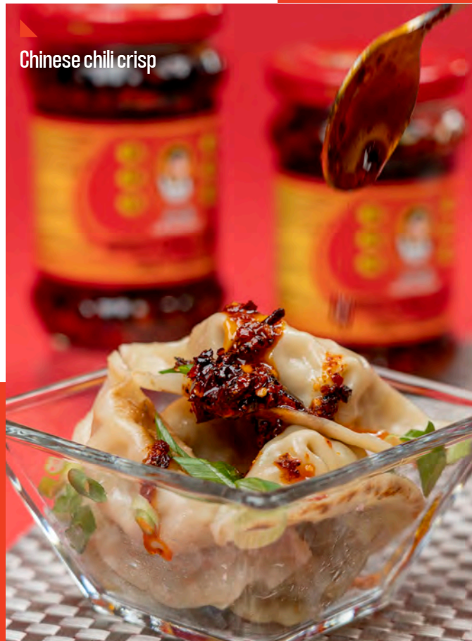
Chinese chili crisp